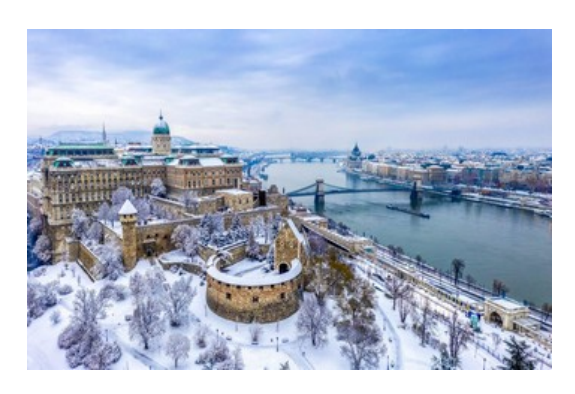
Winter fun in Budapest

ELTE offers Hungarian language and culture courses for their students.